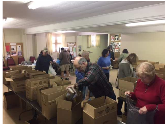
Volunteers sorting and packing food donated by our local Boy Scouts and Cub Scouts during their annual "Scouting for Food" drive.

You can contact him at the church office or on his cell phone 703-314-1665.